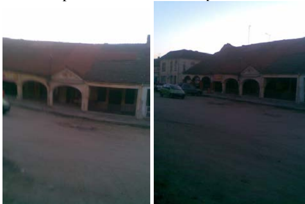
Figure 1. Turkish bazaar Lipova

- The Basilica Minor, Maria Radna, dating back to 1325, the first Franciscan chapel, being built in 1520. The rebuilding of the monastery after the destructions caused by Turkey was made in the year 1626, the stone with the horseshoe of pasha's horse is in the monastery near the second altar. The interior decoration of the Franciscan Monastery from Radna keeps the Rococo and Baroque marks lately classified through the three altars preserved from the eighteenth century;