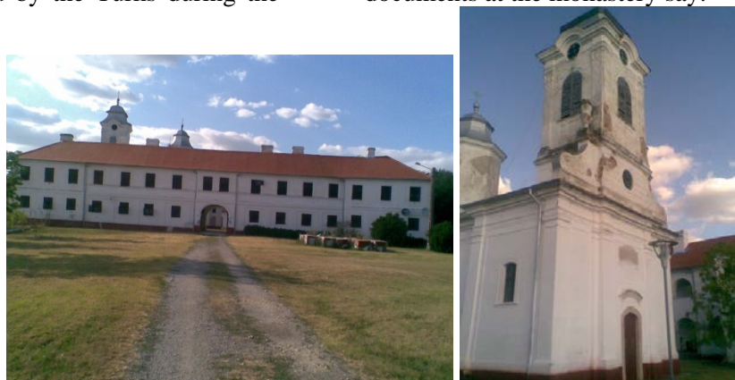
Figure 4. The Cellars Building and the Bezdin Monastery Church

Ottoman occupation of Banat but was not abandoned by monks who built a wooden church in which they served until the building of the brick in 1690 in the Byzantine style in the form of a three with three apses. After 1740 there is a period of development when, besides valuable objects of worship, the icon of the Virgin Mary was brought from Mount Athos, so in 1774 the monastery had important dimensions, 52 rooms, chapel, anteroom, trapeze and 16 monks, nearly 1,000 hectares of land and forest, as the existing documents at the monastery say.