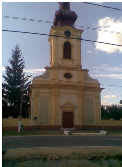
Figure 5. The Roman Catholic Church of Periam

In the typology of the monuments of John Nepomuk at Periam, we find the existence of a statue that follows a serpentine line that suggests a slight footstool having a putto and a crucifix supported on the right shoulder. The entire composition is placed on a profiled socket similar to the statue of the Saint found in front of the Millennium Church from Timisoara, the saint having pluvial and camilaphs on his head.