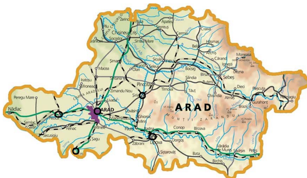
Figure 1. Map of Arad County Black circles show the localities where horses were sampled

eggs per gram (EPG) in the Parasitic Diseases Department laboratory of Faculty of Veterinary Medicine Timișoara. The last samples collected in February 2012 were analyzed by a modified McMaster procedure with a sensitivity of 15 EPG [12] (see Table 1).