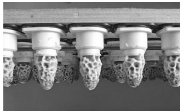
Figure 3. Frame with artificial queen capped cells

After 24 hours, the frame with artificial queen cells will be removed from the starter, introduced in a growing family, and left there for 9 days. After capping (Figure 3), the queen cells will be introduced in Zander-type hatching cages.