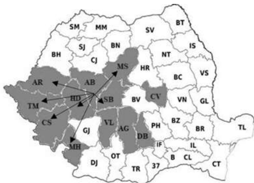
Figure 5. Migration of the population of Oacheșă variety [5]

Sheep bred in these basins have dispersed due to transhumance in all the traditional breeding basins of Romania (Figures 5 and 6) from Maramures, Bistrita, Satu Mare, Bihor to the south extreme Dolj, Olt, Mehedinti.