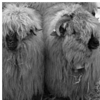
Figure 6. Bucălaie variety of Țurcana [5]

Bucălaie variety of Turcana sheep breed has the hair on the front of the head and on the extremities of the limbs darker or lighter brown (Figure 7). The lambs at birth are smoke-coloured and at 5-6 months of age they turn white except for the extremities which remain chestnut. Lambs that are dark smoky at birth have black wool hairs in the fleece as adults, which is a defect in selection for wool production and are eliminated from breeding.