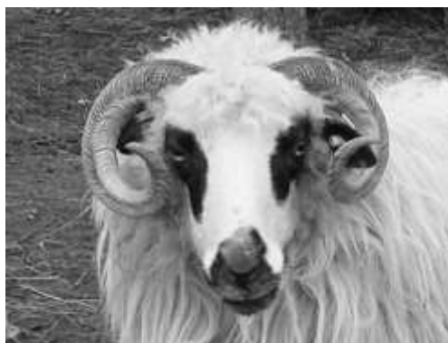
Figure 3. Oacheșă Variety [5]

As a subvariety of the Bălă population, the Oacheșă variety (Figure 4) sheep show a circular outline around the eyes. This population was created over time by careful selection of rams without black spots, which were used on sheep showing the same pattern of wool and fleece colouring.