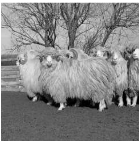
Figure 2. Bălă variety [5]

The thorax is sufficiently wide, long and deep to support the heart and lungs, which are very well-developed anatomical characteristics that favour a high respiratory capacity translated into pronounced vitality, increased feed consumption and finally high milk production. The head is slightly convex with well-developed horns continued with a neck well attached to the trunk, long and thinner than the other varieties [8].