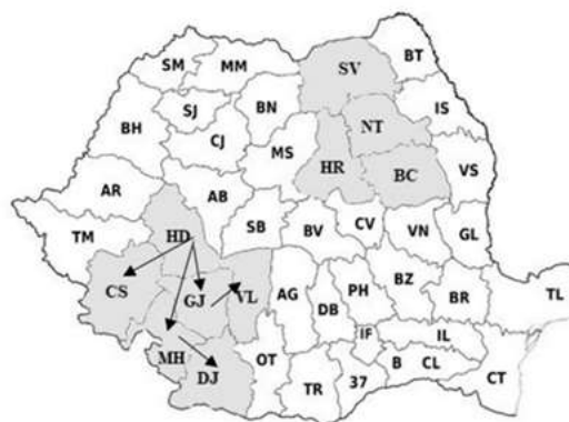
Figure 7. Migration of the population of Bucălaie variety [5]

Bucalaie sheep are mainly bred in the Novaci, Crazna, Baia de Fier, Tismana, Pestisani basins in the Gorj basin and Baia de Arama, Marasesti, Godeanu in Mehedinti county and Ursici, Luncani, Costesti and Cioclovina in the Hunedoara basin (Figure 8). As a special characteristic of this population, they are bred at altitudes of 1400-1500 m in the Parang-Lotru, Orastie and Retezat Mountains.