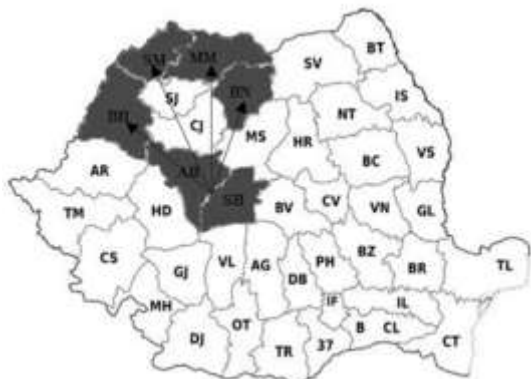
Figure 4. Migration of the population of Bălă variety [5]

Sheep from the Loman and Pianul de Sus basin have a higher body development compared to those from the Poiana Sibiului, Rasinari, Vaideeni and Mures basins.