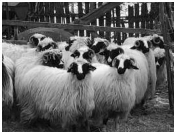
Figure 1. Breaza Variety [5]

Breaza variety of Turcana sheep breed (Figure 1) has as its birthplace the basin of the Jiu Valley bordered by the abrupt peaks of the Parâng, Șureanu and Retezat mountains, with villages such as Petrila, Lupeni, Straja, Campul lui Neag, Aninoasa, Bănița, Jieț, Crivadia, Baru Mare up to Bumbeștii Gorjului. From this region, breeders spread Breaza variety through transhumance, mainly in northern part of Romania (Figure 2).