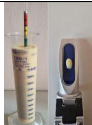
Table 2. Compositional analysis of colostrum from samples collected