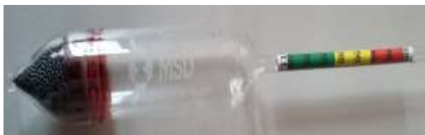
Figure 2. Illustration Colostrometer

Colostrum was collected from Holstein dairy cows at second and third lactation, immediately after calving. Afterwards, the colostrum was evaluated from a physico-chemical point of view to establish its quality.