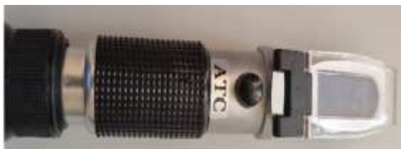
Figure 1. Illustration Refractometer

Bovine colostrum; Distilled water; Graded cylinder; Refractometer; Colostrometer, Combiscope FTIR.