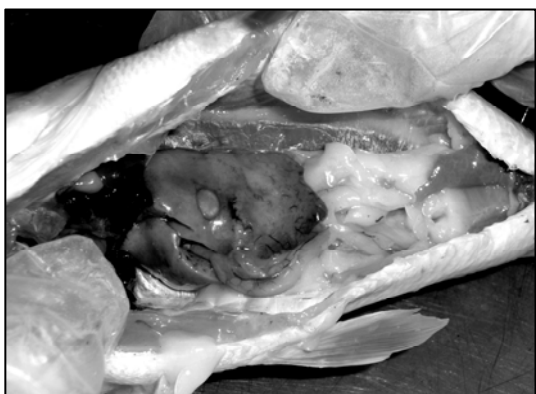
Figure 1. Congestion, haemorrhage and hepatic degeneration in perch – Eustrongylides infection

The pathogenicity of the larvae was obvious in both infections. In eustrongylidosis it consisted of congestion, haemorrhages, chronic inflammation, granulomas, ascites and, especially in rapacious carp and perch, severe visceral and mesenteric adhesions (fig. 1). In most cases, the larvae were found free into the body, whilst in rapacious carp only encysted larvae were found.