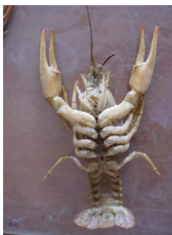
Figure 3. River lobster male – ventral wieu (original photo).

The pereiopodes of lobster males had different lengths. The first pair measured in average 10.91 \pm 0.42 cm, the second pair 6.06 \pm 0.22 cm, the third pair 7.21 \pm 0.21 cm, the fourth pair 6.57 \pm 0.16 cm and the fifth pair 5.85 \pm 0.15 cm. Reporting the average length of pereiopodes at average legth of the first pair of pereiopodes, the third pair touch 66.09%, the fourth 60.22%, the second pair 55.55%, and the fifth pair 53.99%. Between the males involved in study exist a medium variability (CV between 10% and 20%) for the length of all pereiopodes. The average established for every pair of pereiopdes has satisfy precision ( S_x \% < 5\% ).