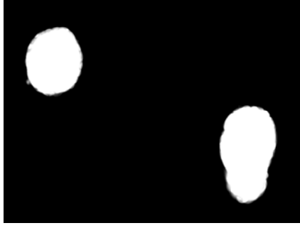
Figure 3. Blastocyst and hatched blastocyst evaluated as viable by Fluorescein diacetat staining test (original)