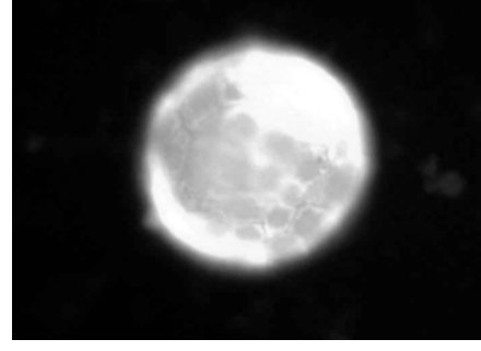
Figure 4. Viable blastocyst evaluated by Fluorescein diacetat staining test (original)

The nonviable embryos without enzymatic activity inside the cells lost their capacity to bind and transform the Fluorescein diacetate to fluorescein and showed no fluorescence while were exposed to the fluorescence sources of the microscope.