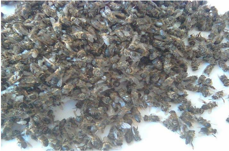
Photo 2. Dead bees